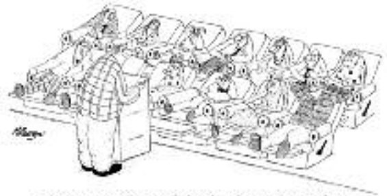
The recommendation of the church growth consultant to get rid of hard wooden pews was quickly accepted at Eastside Church.

Remember the Eisenhower Administration? If you don't, our pew cushions do—they've been around quite a while. We can't provide recliners but new pew cushions would make our time together on Sundays so much more comfortable. Consider donating to the Pew Cushion fund.