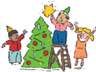
Evening With Santa

Faith & Fellowship invites you to our annual Christmas Brunch immediately after Worship in Fellowship Hall.