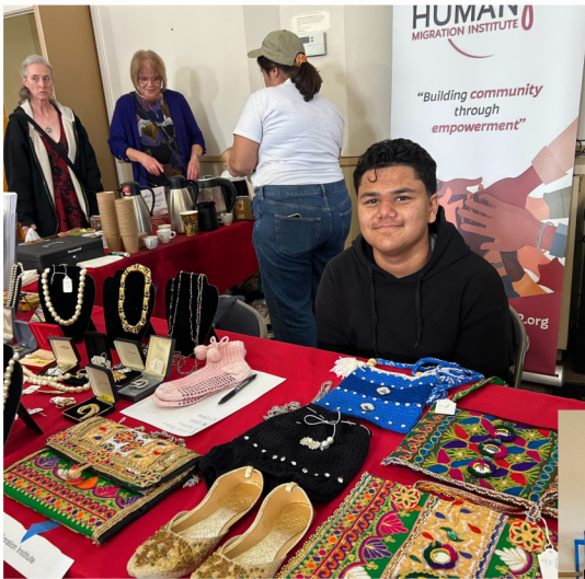
Human Migration Institute works with refugees