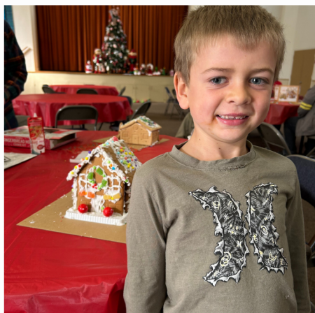
A proud construction worker