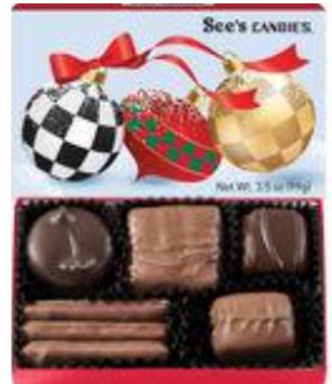
Yum! See's Candy!