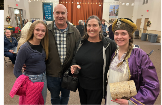
The Zeebs at Live Nativity

We followed the star of Christmas love and found gift givers, angels, bells, shepherds, hot cocoa, cookies and fellowship at Live Nativity on Dec. 22. Two days later we held candles for our two Christmas Eve services. Thanks to all the organizers and all the volunteers!