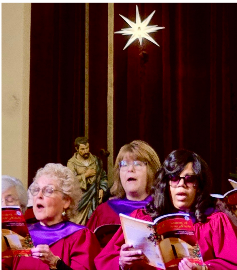
A highlight of Advent is the Aldersgate Chorale's Christmas Cantata. This year on Sunday, Dec. 15, the choir sang "A Ceremony of Lessons and Carols."