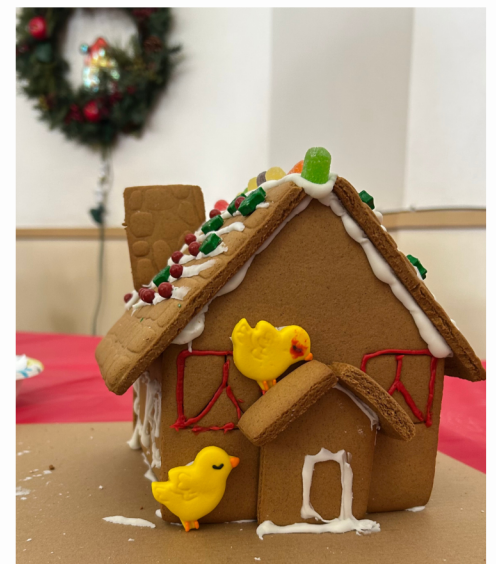
chickens deserve gingerbread houses too