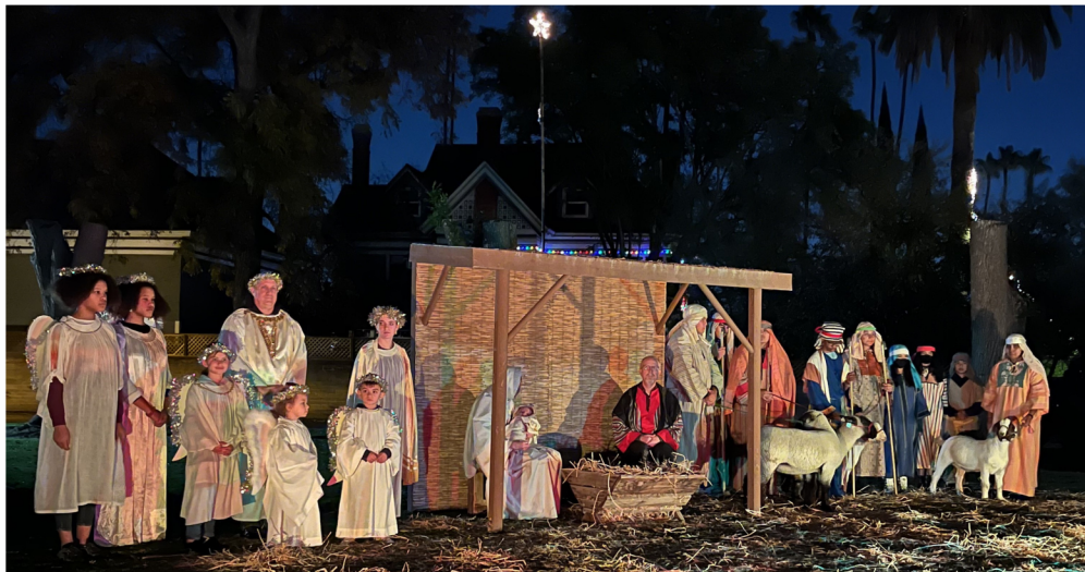
The angels and shepherds gather at the manger.