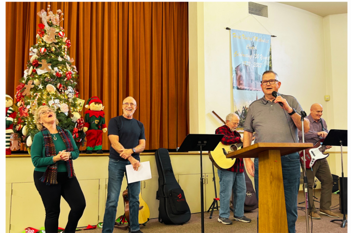
The Response at Last Year's UMM Christmas singalong.

We hope that you can join us for this time of fellowship. The UMM Prayer Breakfast meetings continue at 7 am on Friday mornings in Mary's Kitchen at the church.