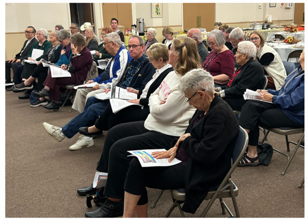
Charge Conference Crowd