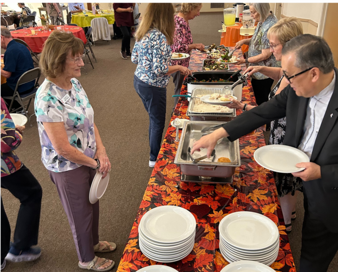
The buffet included creamed turkey, biscuits, veggies and pumpkin pie for dessert