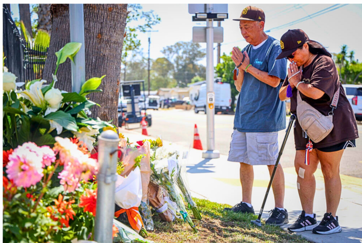
(Photo of the Islamic Center in San Diego)