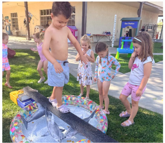
Watch out, sharks below!

Follow Fumps_preschool on Instagram for more pictures.